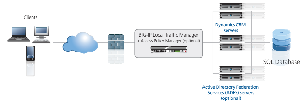
Figure 1: Logical configuration diagram

The BIG-IP LTM system provides intelligent traffic management and high availability for Microsoft Dynamics CRM deployments. You can also use the BIG-IP APM module to provide secure remote access and proxy authentication to your Dynamics CRM implementation. The following diagram shows a simple, logical configuration.